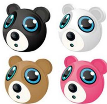
Care camera with Artificial Intelligence for homecare and elderly care facility