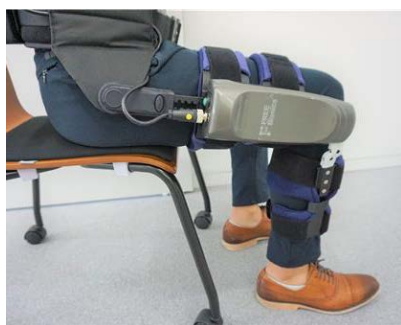
Compact single joint exoskeleton robot with several special muscle training models