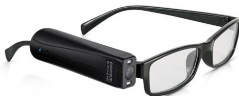
Most advanced Artificial Intelligence device for the blind and visually impaired